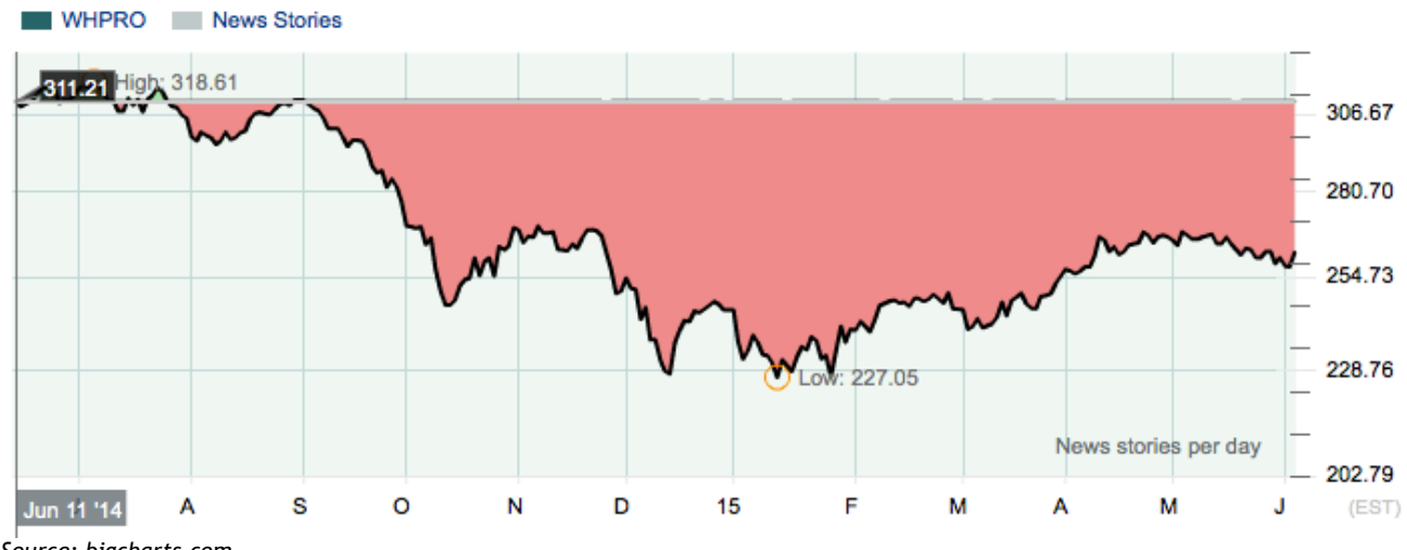
First, just the Progressive Energy Index (WHPRO) over a past 1 year to early-June 2015: