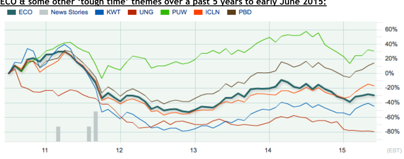
ECO & some other 'tough time' themes over a past 5 years to early June 2015:

Cleaner Fuels - 9% sector weight (3 stocks @2.50% each; +3 *banded stocks) Air Products & Chemicals, APD. Hydrogen, is a supplier of industrial gases. *Amyris, AMRS. Biotech, speculative R&D in renewable fuels for transportation. *Hydrogenics, HYGS. Hydrogen, electrolysis generation & fuel cells, H2 storage. *Quantum Fuel Systems, QTWW. Compressed gas, in alternative fuel vehicles. Renewable Energy Group, REGI. Biodiesel, natural fats, oils, greases to biofuels. Solazyme, SZYM. Biofuels, microalgae grown w/o sun, drop-in diesel substitute.