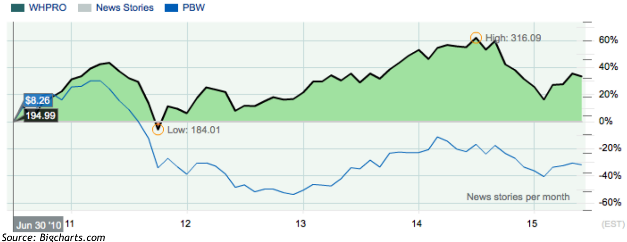
Chart for the WHPRO Index (bold) Past 5 years vs an independent ECO tracker:

WHPRO Index for past 5 years from June 2010 at near 195 - through end of May 2015 near 260. Unlike some 'greener energy' themes, its low in 2011 (near 185) actually was relatively 'better' than lows put in by some other various clean energy themes last 5 years. Thus much different is an ECO tracker in blue that dropped hard in 2012; unlike ECO, WHPRO in these years generally was less volatile - but that changed in 2014 when WHPRO fell especially in the latter year.